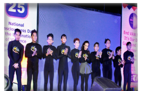
The El Gamma Penumbra after their performance