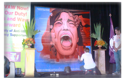
Symbolic presentation of milestones